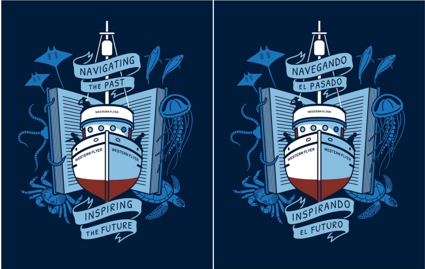
Pocket Design – English and Spanish